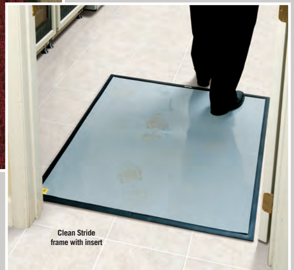
Clean Stride frame with insert