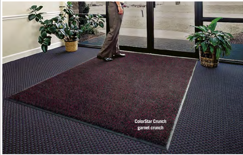
ColorStar Crunch garnet crunch