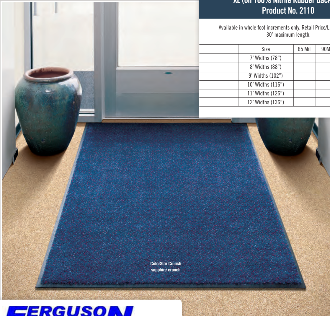
ColorStar Crunch sapphire crunch