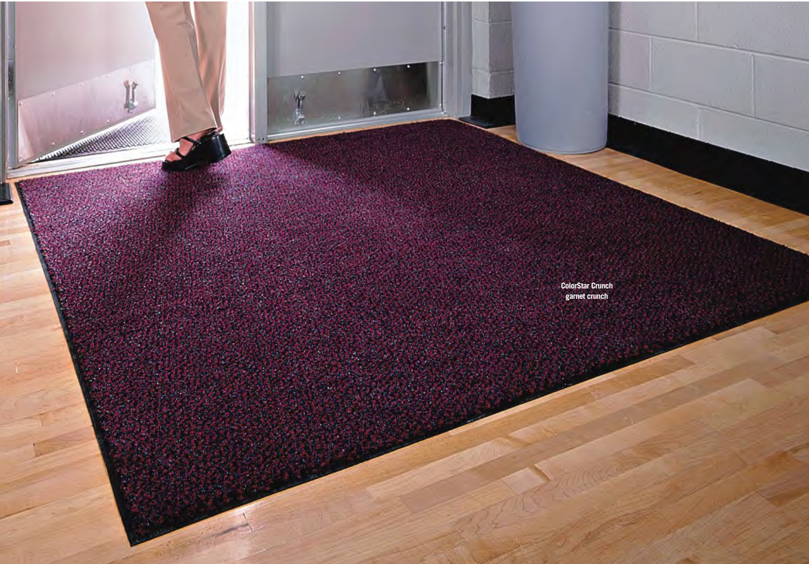
ColorStar Crunch garnet crunch