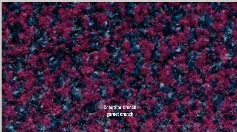
ColorStar Crunch garnet crunch