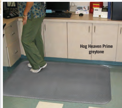
Hog Heaven Prime greytone