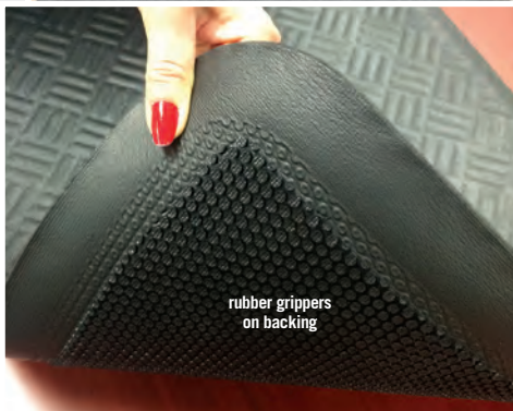
rubber grippers on backing