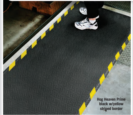
Hog Heaven Prime black w/yellow striped border