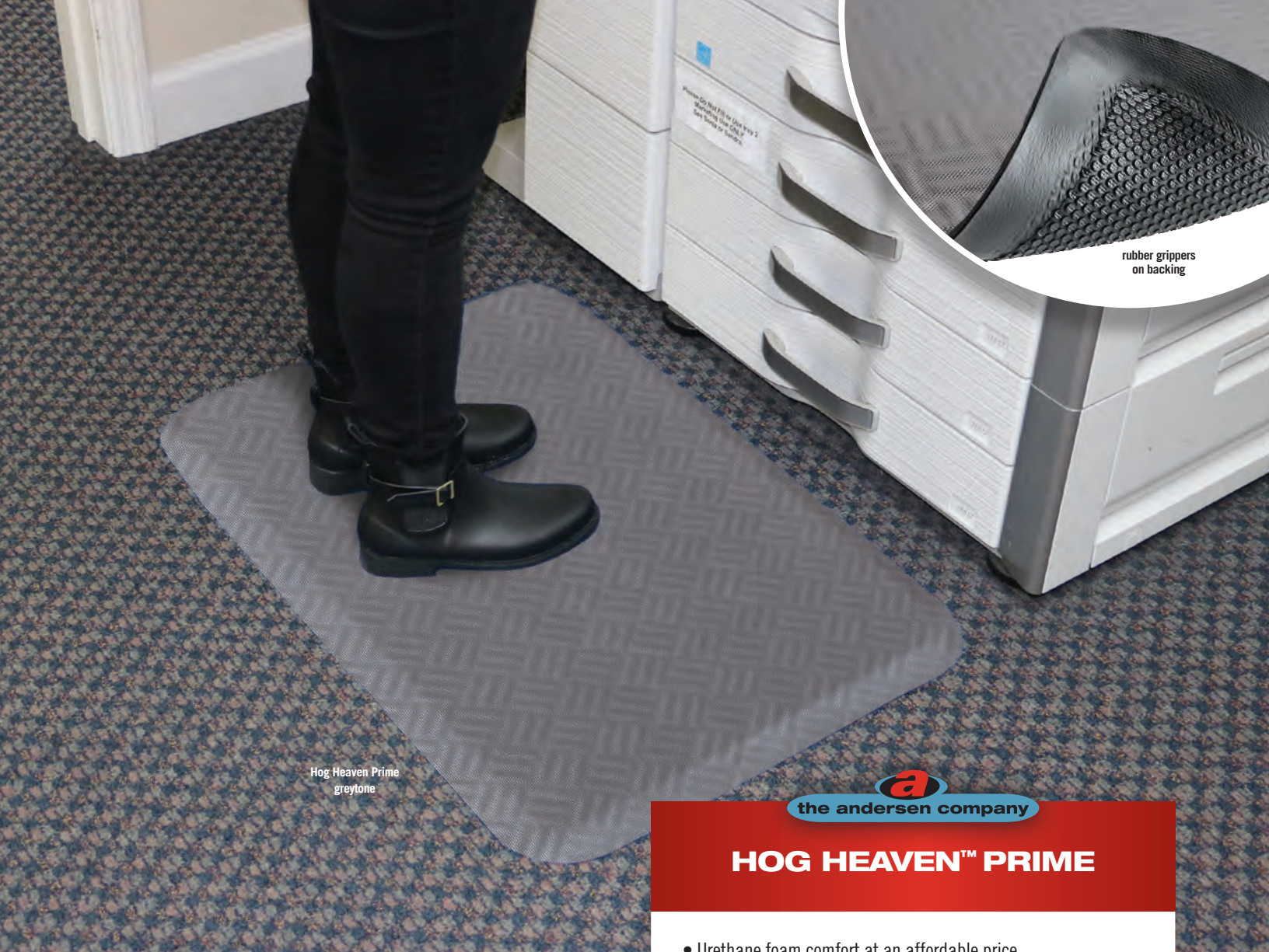
rubber grippers on backing