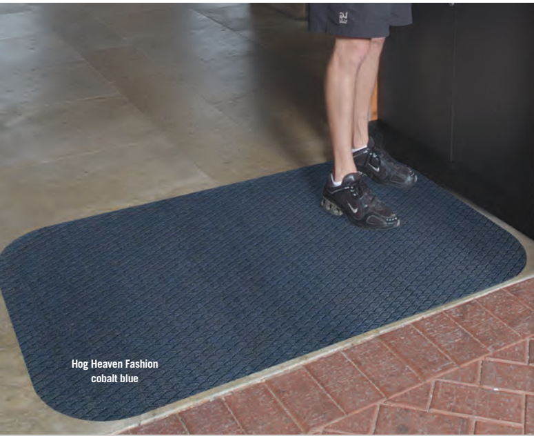
Hog Heaven Fashion cobalt blue