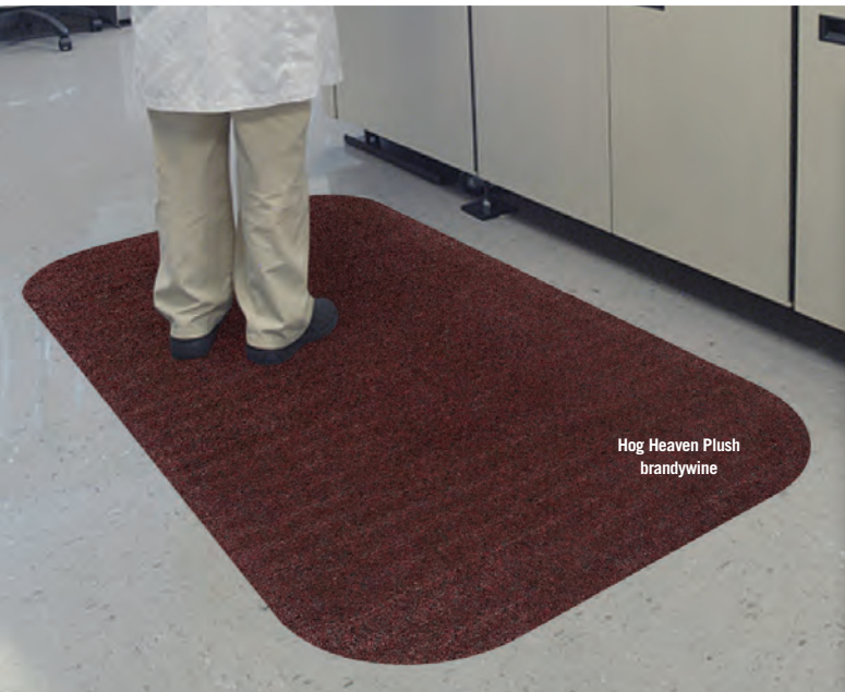
Hog Heaven Plush brandywine