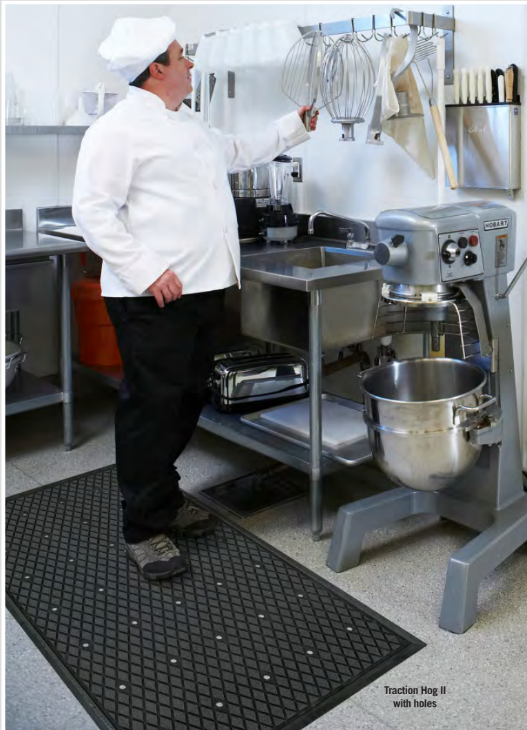
Traction Hog II with holes