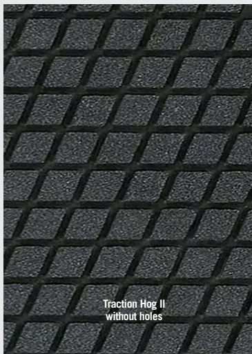
Traction Hog II without holes