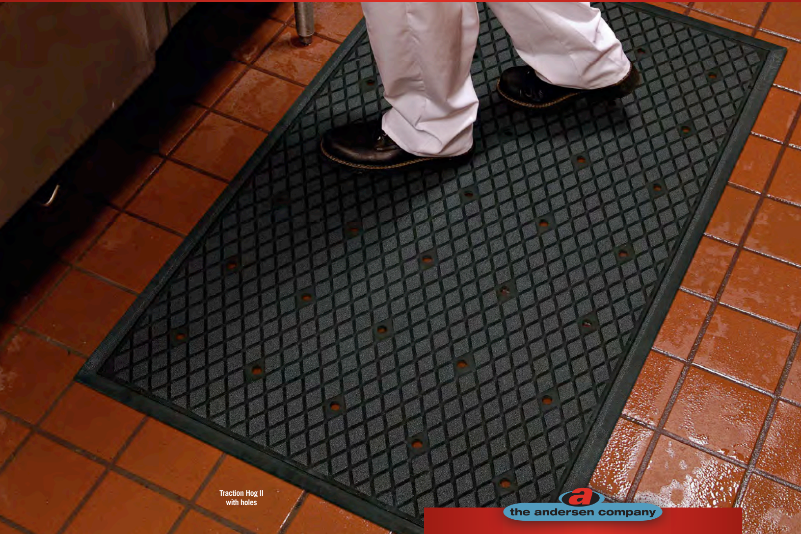
Traction Hog II with holes