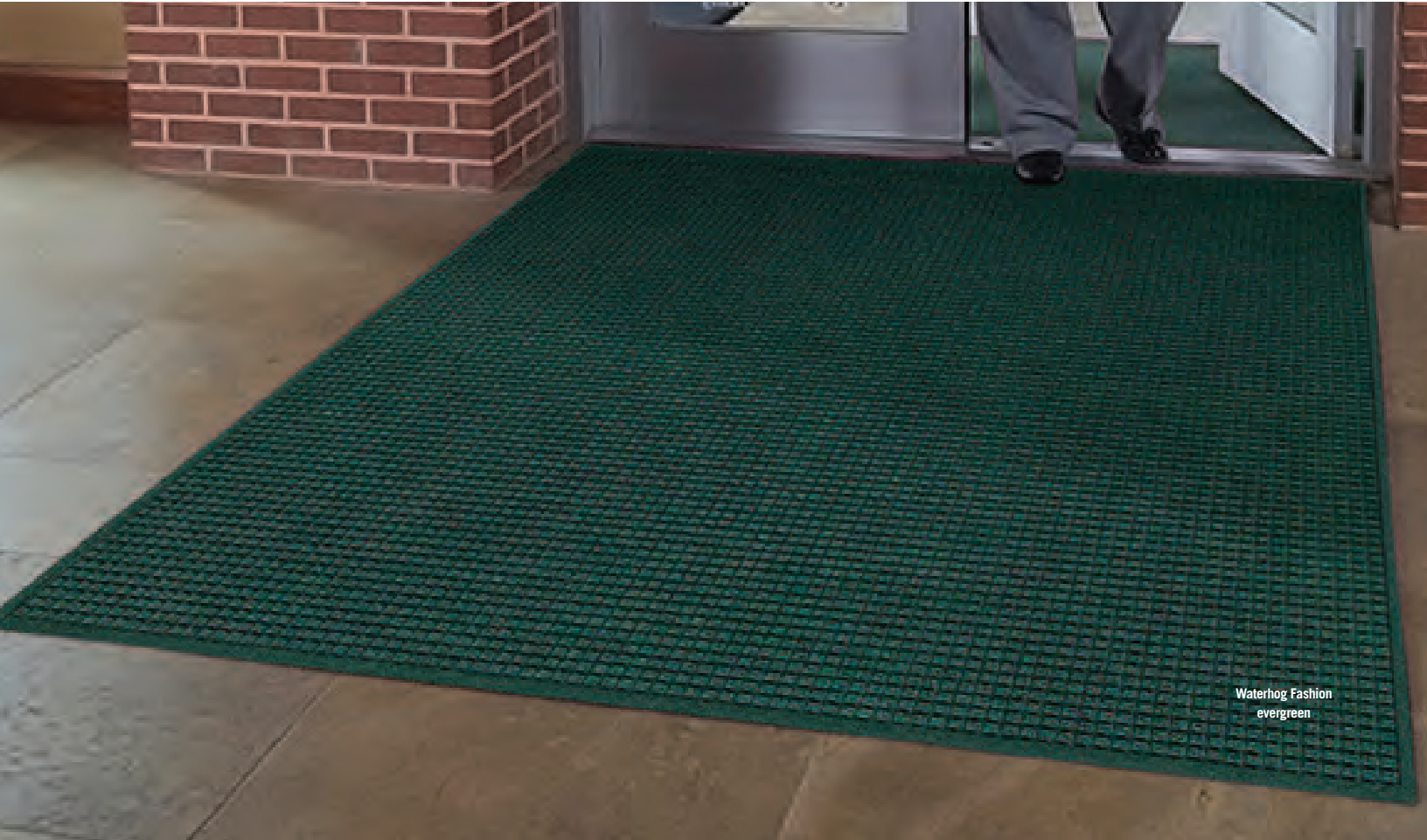
Waterhog Fashion evergreen