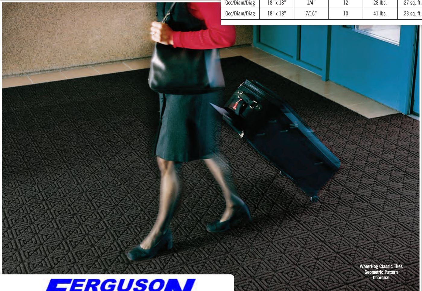
WaterHog Classic Tiles Geometric Pattern Charcoal