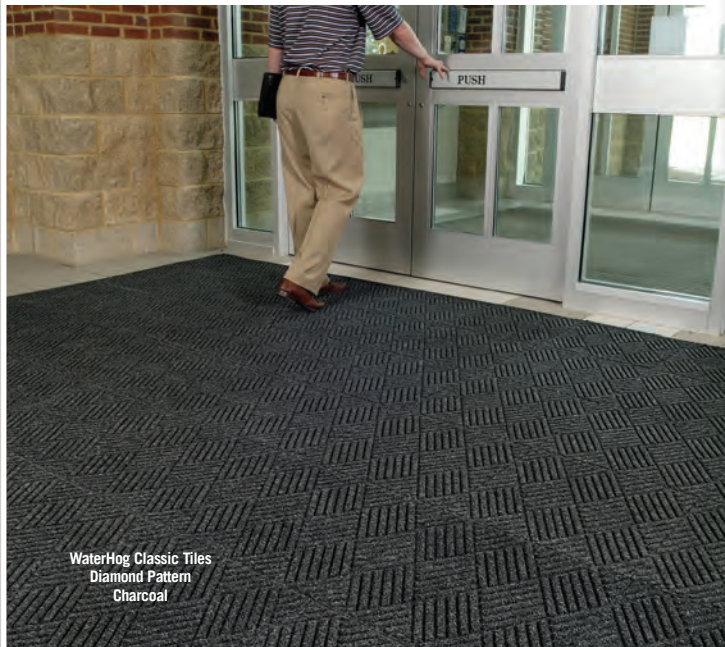
WaterHog Classic Tiles Diamond Pattern Charcoal