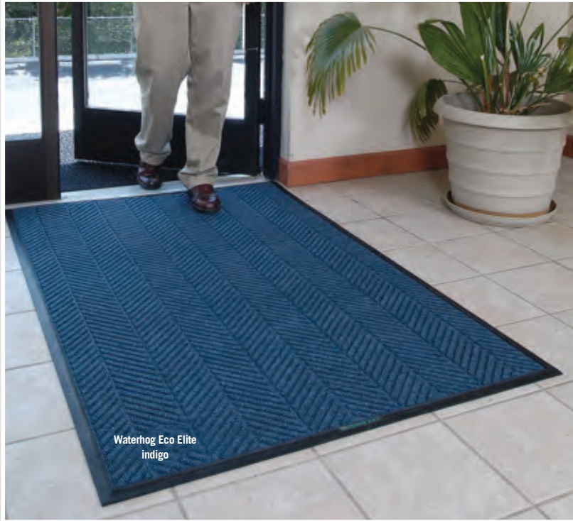
Waterhog Eco Elite indigo