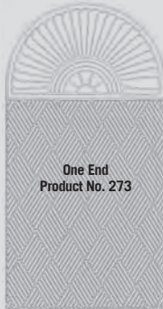
One End Product No. 273