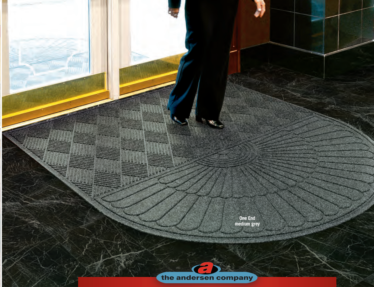
One End medium grey