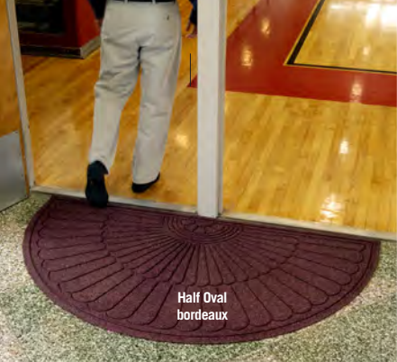
Half Oval bordeaux