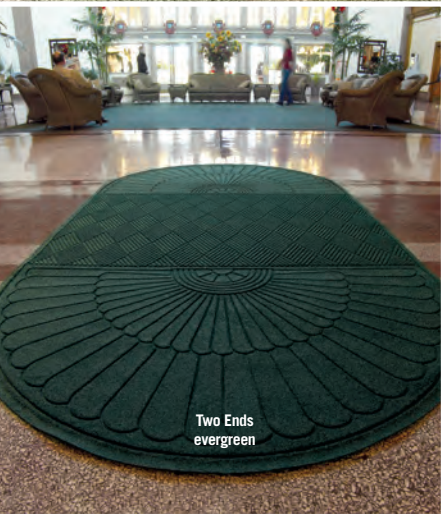
Two Ends evergreen