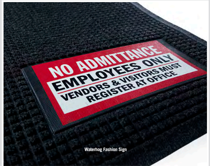
Waterhog Fashion Sign