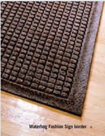
Waterhog Fashion Sign border